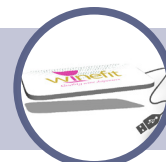
RFID CARD READER / WRITER