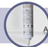
ARGON GAS CYLINDERS