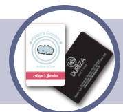
WINEFIT EVO RFID CARDS