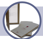
BY THE GLASS LIST