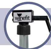
SPECIAL CAPS 2.0 FOR EVO MACHINE